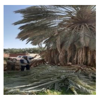
Fig. 6. Non-pruned male date palm