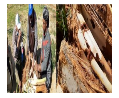
Fig.11 . Severe injury in the palm heart(Jumara) despite repeated external spraying with pesticides

4.9 Lack of Cooperation among Farmers for Collective Control : Farmers in the same area often fail to cooperate in collective efforts to combat red palm weevil, undermining the effectiveness of control measures.