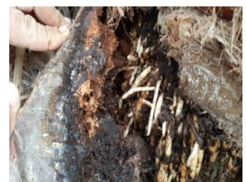
Fig. 9. Aerial roots