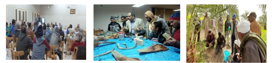
Fig.1. Activity of the training courses

These factors contribute to delayed detection of infestations, slow implementation of control measures, and an increase in the severity and spread of the pest. To address these issues, farmers were trained on the basic biological and ecological characteristics of the red palm weevil, including the symptoms of infestation. This training was particularly important for palm owners in healthy areas. Moreover, farmers were encouraged to allocate a budget for pest control and to seek information from reliable, scientifically-backed sources.