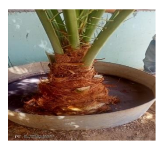
Fig.3 .Immersing the offshoots in the pesticide solution for 15 to 20 minutes