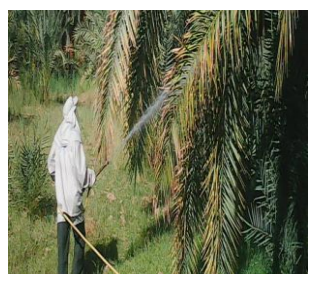
Fig.2. Protection spraying with pesticides after pruning