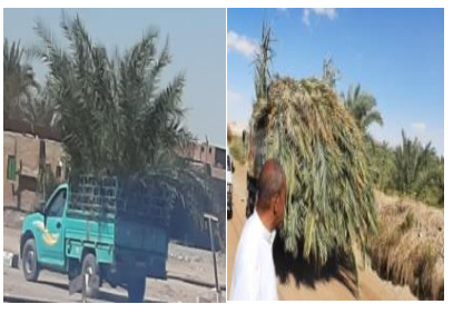
Fig. 4. Transfer of offshoots and palm leaves from infested farms to healthy areas