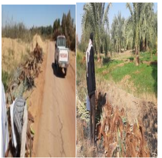
Fig.5. Leaving palm waste on the edges of the walkways and internal roads